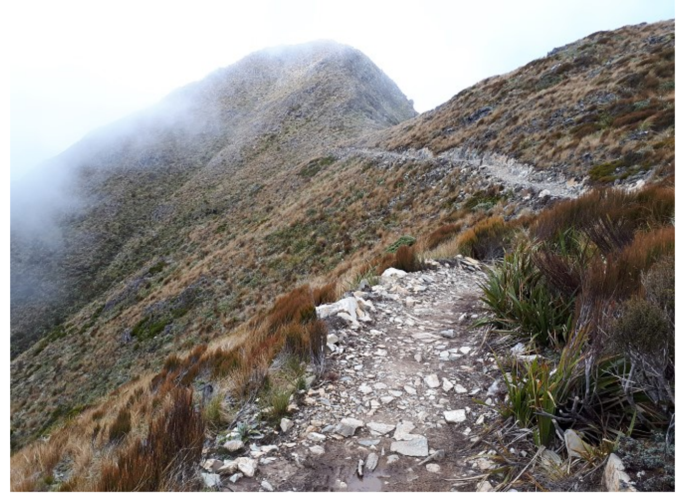
Lots of new track has been carefully built in the tops