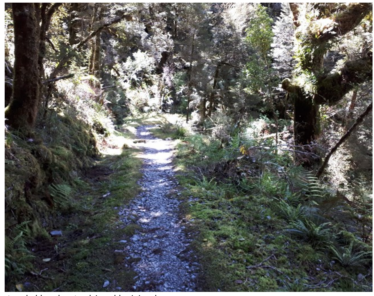
This part probably a dray track in gold-mining days