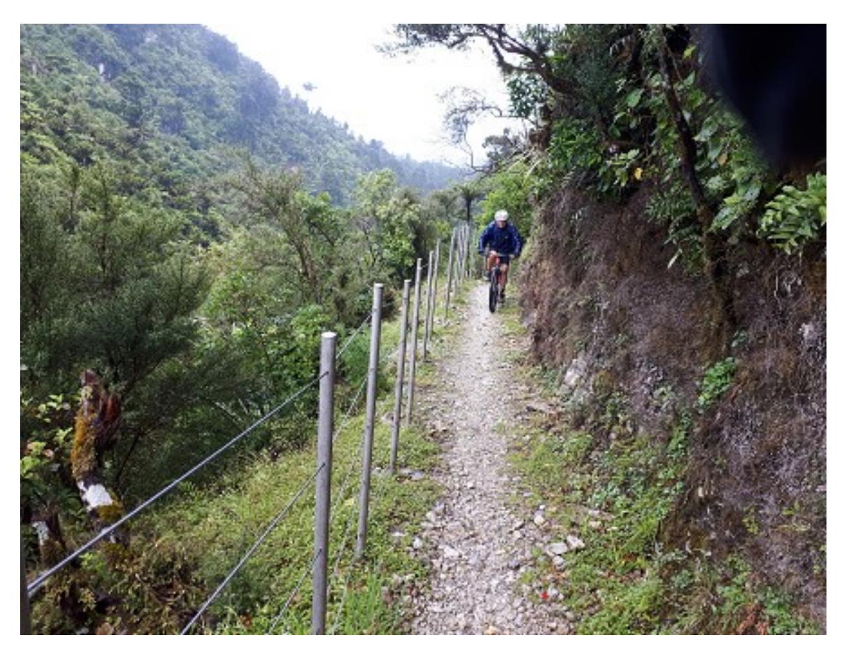
Safety Barriers built where drops are precipitous.